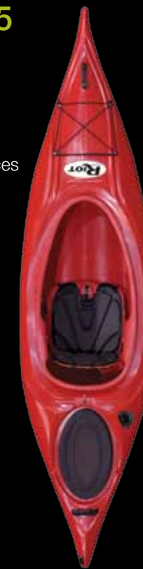
Cross-Max Rotomolded Polyethylene Construction