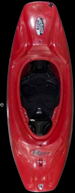
Cross-Max Rotomolded Polyethylene Construction