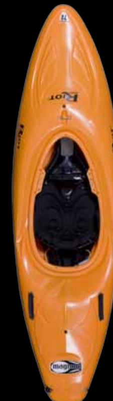
Cross-Max CONSTRUCTION Rotomolded Polyethylene Construction