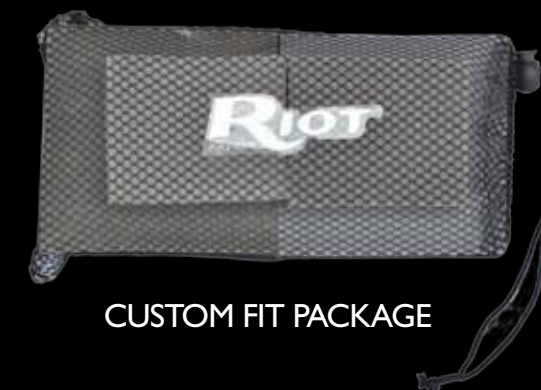
CUSTOM FIT PACKAGE