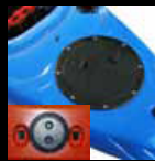
10" DECKPLATE HATCH KIT