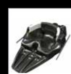
POWER SEAT (WHITEWATER)