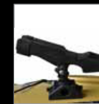
ADJUSTABLE ROD HOLDER KIT