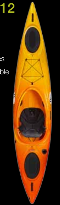
Cross-Max CONSTRUCTION Rotomolded Polyethylene Construction