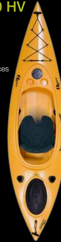
Cross-Max Rotomolded Polyethylene Construction