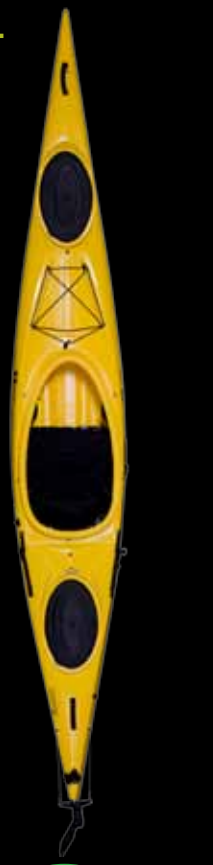
Cross-Max CONSTRUCTION Rotomolded Polyethylene Construction