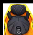
CUSTOM FIT SEATING SYSTEM