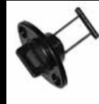
DRAIN PLUG KIT