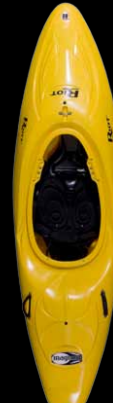
Cross-Max CONSTRUCTION Rotomolded Polyethylene Construction