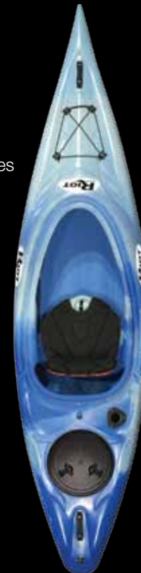
Cross-Max Rotomolded Polyethylene Construction