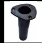
FLUSHMOUNT ROD HOLDER KIT