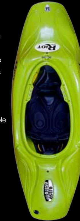
Cross-Max Rotomolded Polyethylene Construction