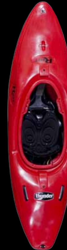
Cross-Max Rotomolded Polyethylene Construction