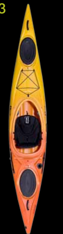
Cross-Max CONSTRUCTION Rotomolded Polyethylene Construction