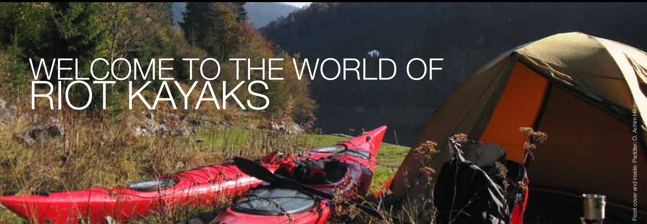
Front cover and inside: Paddler: O. Achim Hilgert

We believe kayaks are a great way to get in touch and stay in touch with the outdoors.