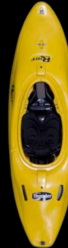
Cross-Max Rotomolded Polyethylene Construction