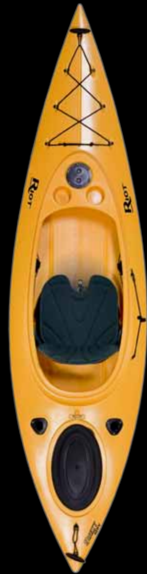
QUEST 10 HV