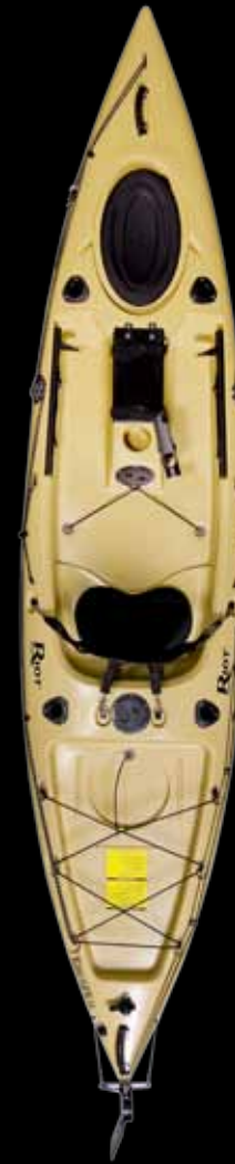
ESCAPE 12 ANGLER